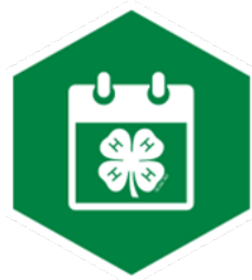
Marin 4-H Calendar