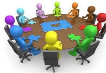
Marin 4-H Club Leader Dinner & Orientation Thursday, August 22, 6:00-8:00pm, 4-H Office