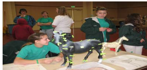
Morning Sun Horse Club

The Marin County 4-H Council is now offering $2500 in scholarship funds. Current high school 4-H members and former 4-H members who have graduated in the past two years recently received applications for county 4-H scholarships. Applications will be due to the 4-H office by Friday May 8, 2009. No late applications will be accepted. Scholarships will be awarded in June. For more information contact the 4-H office at 499–4207.