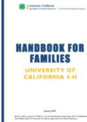
4-H Handbook for Families