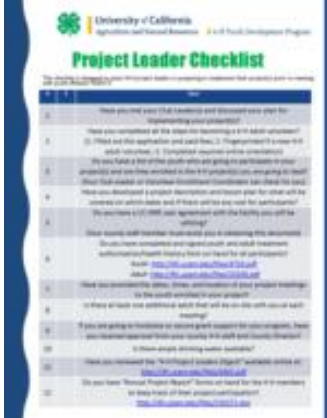
Adult Project Leader Checklist