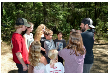
Marin 4-H Camp, July 14-21 in the Las Posadas State Forest