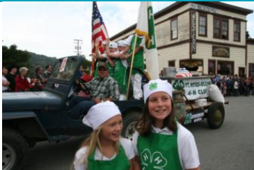
West Marin Fair, June 2, 12-3:30pm, Point Reyes