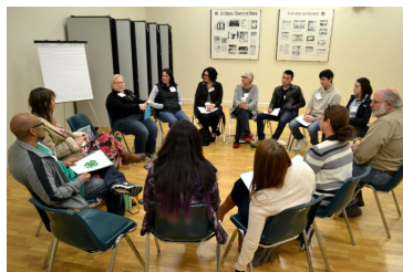
(New!) 4-H Club Leader Dinner & Orientation, August 23, 6:00 - 8:00pm, UCCE 4-H Office