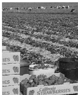
Three acres of organic strawberries bloomed on the Sartori Ranch in 2002.