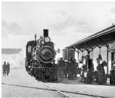
The Northern Pacific Railroad station in Point Reyes Station, circa 1870, one of many stops along the north coast.

Irish, Portuguese, and Swiss immigrants found their way to Marin and began to develop the fledgling dairy business, milking small herds by hand, and traveling miles over bumpy roads to get their milk to the "stations," which turned the white gold into butter and cheese. The entrepreneurs were on a roll and realized that dairying was the future. By 1860 Marin was the largest dairy producer in California, providing one-fourth of the state's butter.