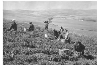
800 acres of peas were grown above Drake's Bay in 1938.