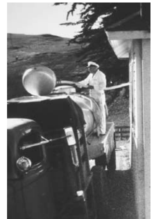
By 1950, with improved refrigerated hauling technology, dairy was king in Marin, as the population increased.

By 1950, dairy was still the predominant form of agriculture with 200 dairies in production. The creation of the Point Reyes National Seashore in the 1970s and market forces influenced the switch from dairy to beef cattle operations, as our agricultural diversity declined. By the 1950s, field and row crops disappeared entirely from the crop report.